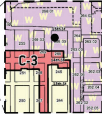
2 TAX MAP/LOCATION MAP SCALE: NTS